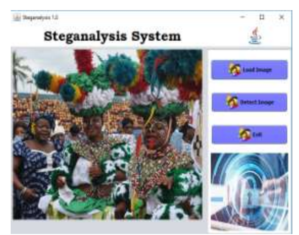
Figure 5: Selected image displayed on GUI.

Next, the user clicks on the "Open" button command. This will prompt the Steganalysis System to load the image within the JPanel on the system GUI. This is shown in Figure 5.