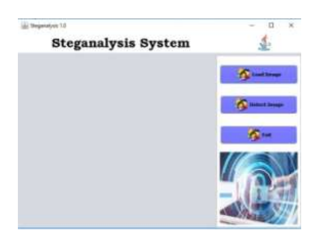
Figure 2: Initial Screen

The user is presented with the screen shown in Figure 2: